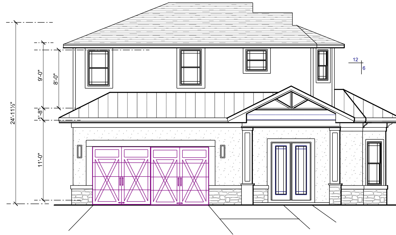
JESSIE AVE. ELEVATION