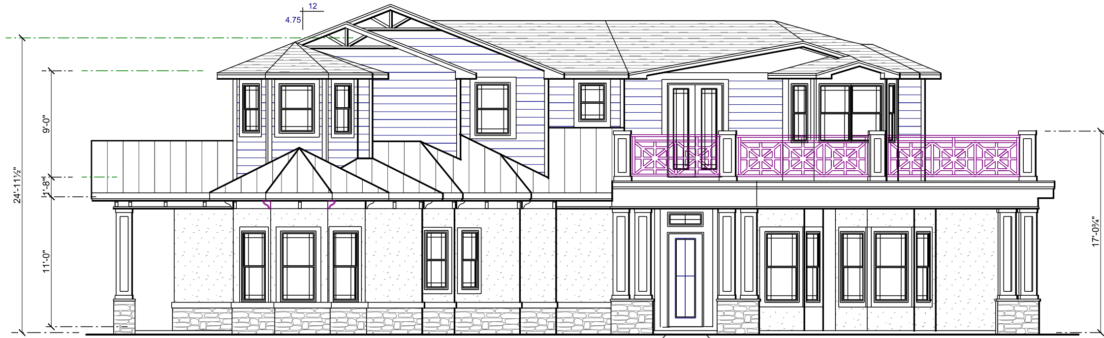
HAMILTON AVE. ELEVATION